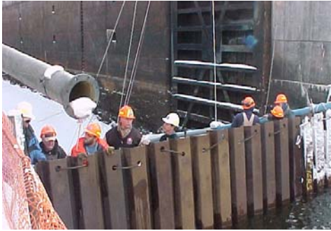
Squadron members Looking at Lock 21 - December '03

Each year we have seen how the locks are carefully repaired and serviced for the next year. Each year we move on to the next lock in the system.